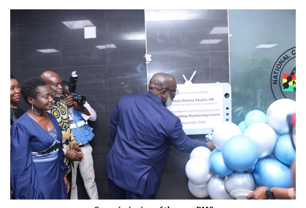
Commissioning of the new BMC

Since the establishment of the system, several Regulators within the continent such as the Nigerian Broadcasting Commission (NBC) and the Ministry of Science, Innovation and Technology, Nigeria have visited Ghana and the NCA to benchmark Ghana's progress. For the Nigerian Broadcasting Commission, the visit was to help them in their bid to establish something similar to monitor the Nigerian media ahead of their upcoming national elections in February 2023 amongst other things.