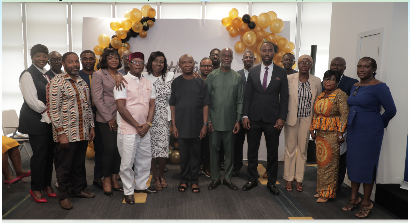
Honoured retirees and their families in a group photograph with some Management Staff