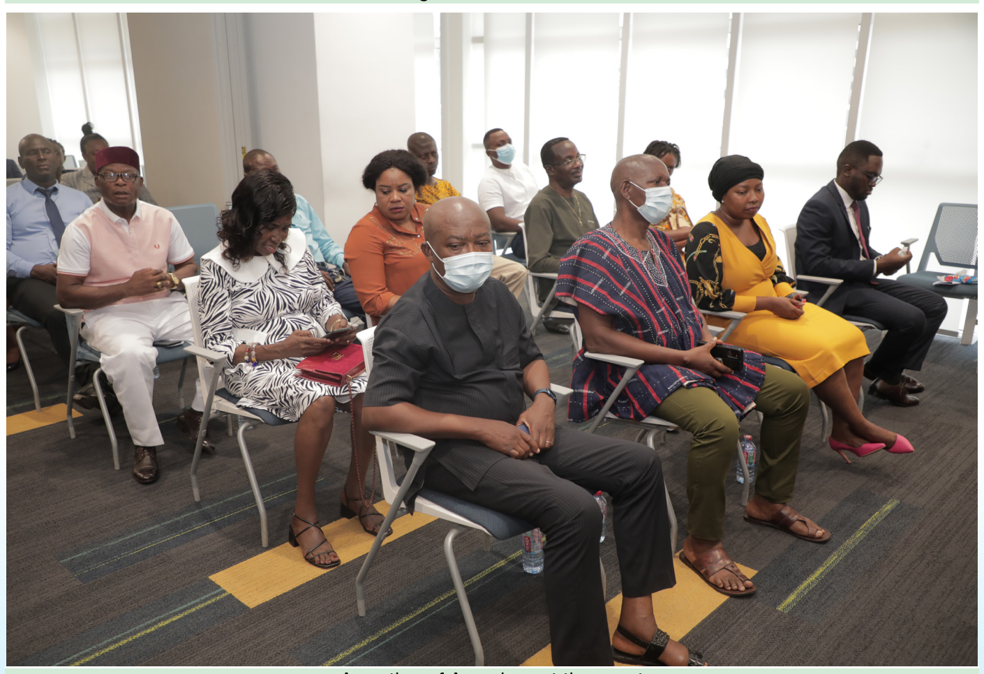
A section of Awardees at the event