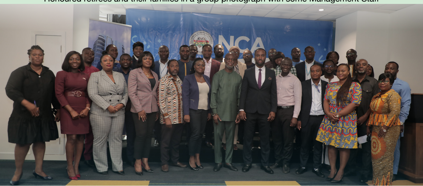
Awardees in a group photograph with DG and some Management Staff

Congratulations to our hardworking and deserving Staff. Ayekov!!