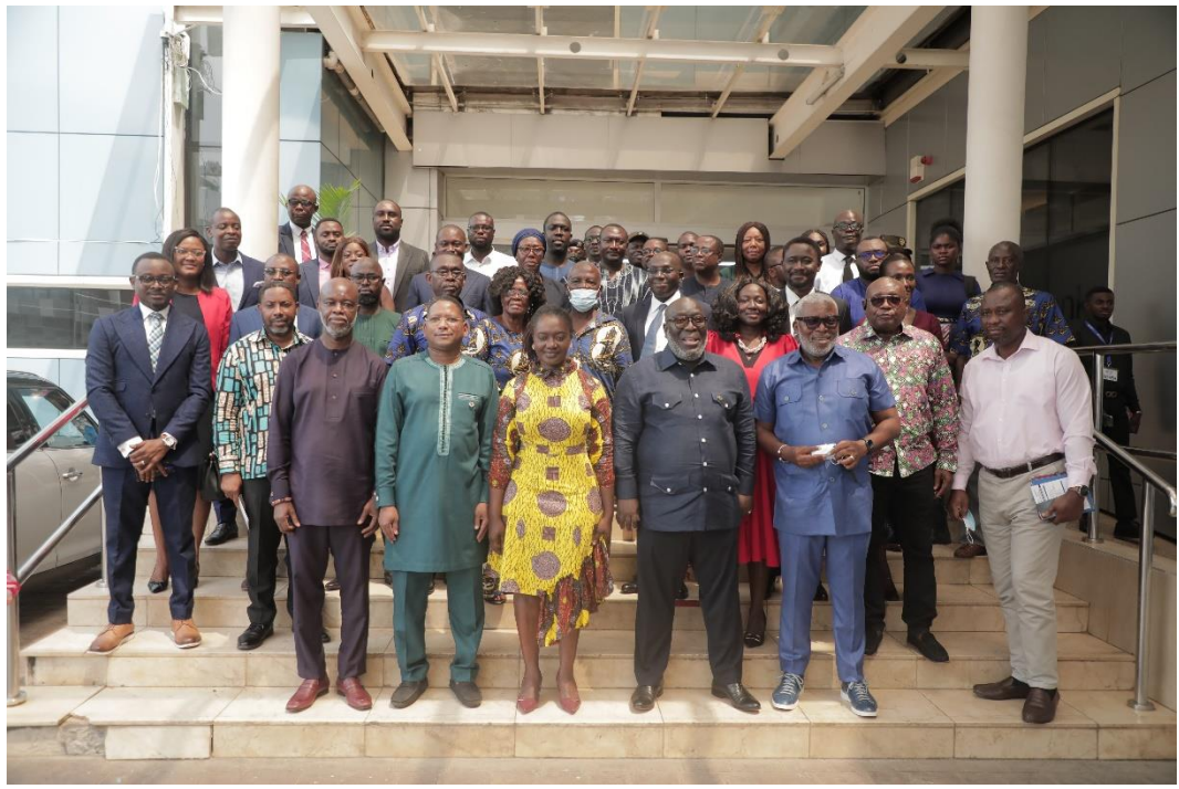
A group photograph of some participants with Deputy Minister for Communications and Digitalisation

conversation on a policy framework to lead ICT digitalisation for inclusiveness in the health sector.