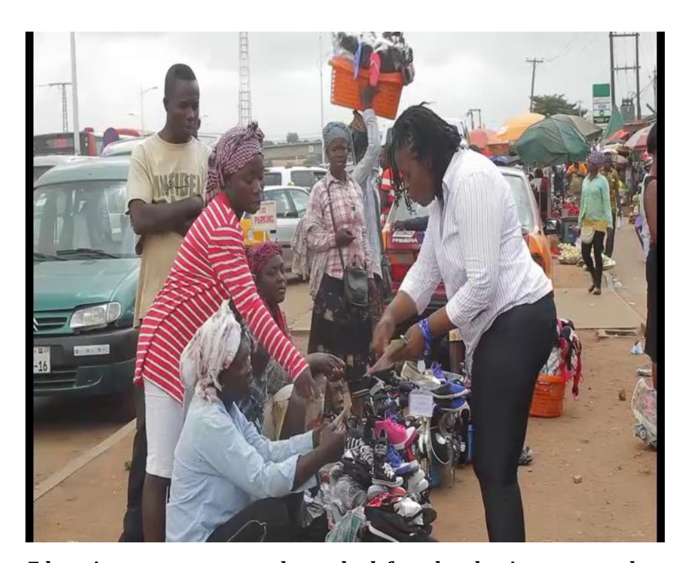
Educating consumers on what to look for when buying a set top box.