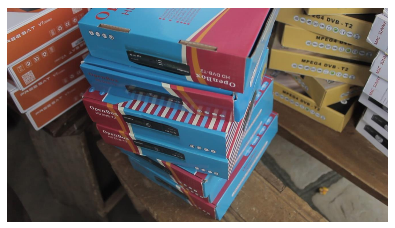
Some of the seized set top boxes from Lapaz.