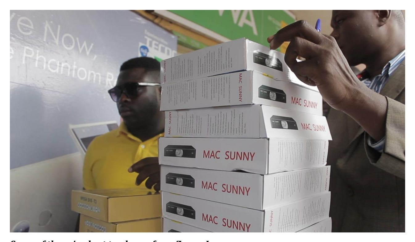
Some of the seized set top boxes from Zongo Lane.

The migration from analogue to digital television broadcasting would most likely have an impact on almost every citizen of this country considering the pervasiveness of terrestrial TV. It is therefore important that the migration is properly managed to ensure that every Ghanaian who watches TV today is able to continue watching TV in the digital domain