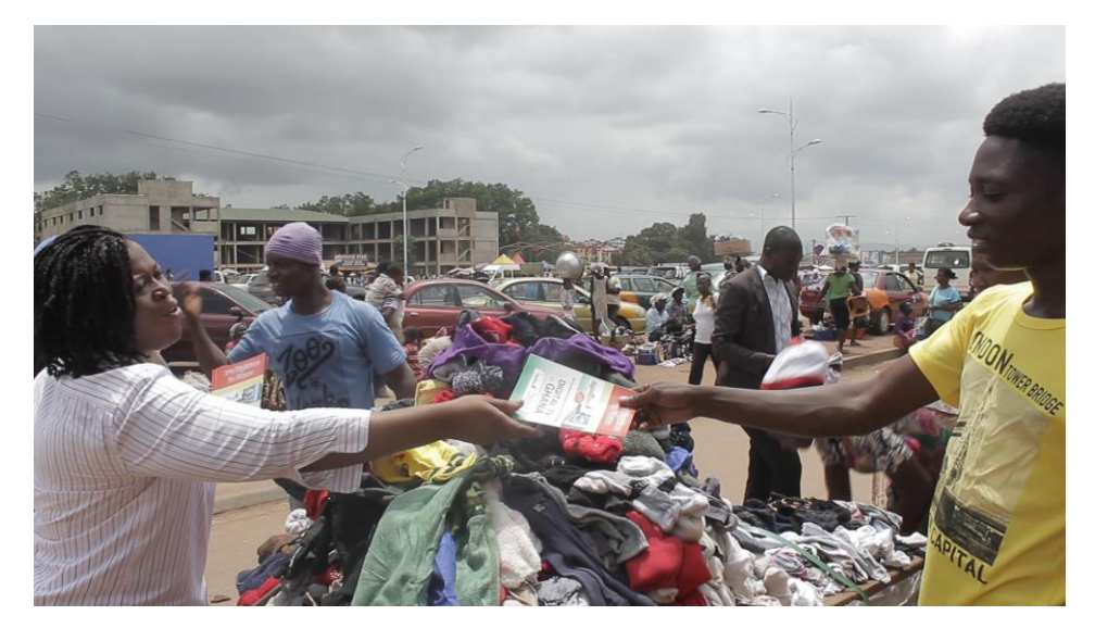
Educating consumers on what to look for when buying a set top box.